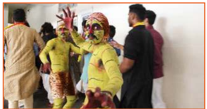
Kannada Rajyotsava Celebration

The College celebrated Kannada Rajyotsava with pomp and splendor on 25 th November, 2017. The main attraction of the event was Hulivesha and Palegara. In addition to this, the students collected old and unused clothes from faculty members and fellow students to donate to Goonj, a non-governmental organization which highlights clothing as a basic need and undertakes disaster relief, humanitarian aid and community development across India.