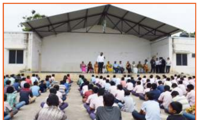
NSS Activities at Adakimaranahalli