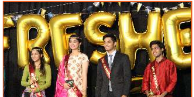
Fresher's Day Celebration