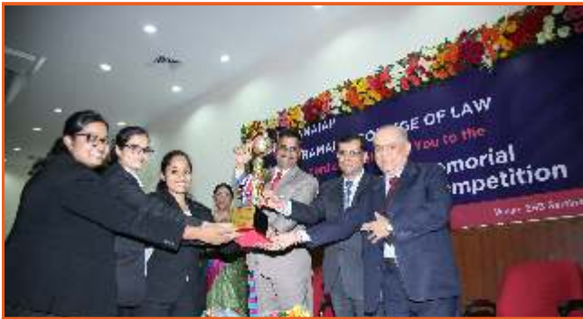
Winners of Moot Court Competition

The teams won a cash prize of Rs. 25,000/- and Rs. 20,000/- respectively along with a six-month subscription of Manupatra for each member of the team.