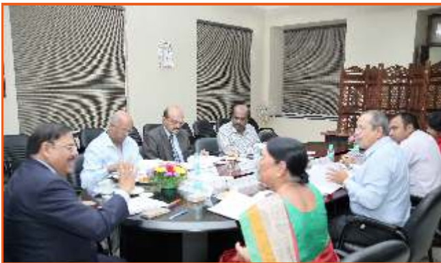
Governing Council Meeting

The Governing Council meeting of Ramaiah College of Law (RCL) was held on 15 th December, 2017. The meeting focused on curricular, co-curricular and extra-curricular performance and achievements of the academic year 2017-18. The members of the Governing Council appreciated the overall initiatives taken by the College and also proposed certain key changes to be incorporated in the upcoming semester.