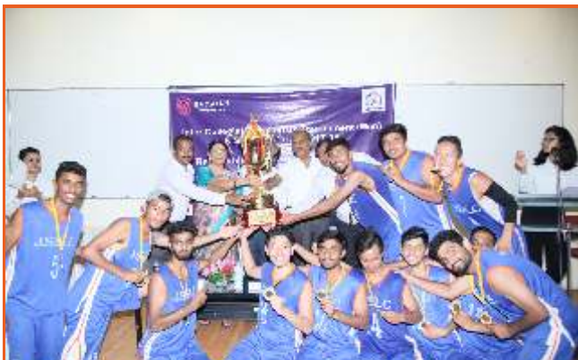
Winners of the Tournament

The Tournament saw JSS Law College, Mysuru clinching the Winners Trophy. Sheshadripuram Law College, Bengaluru were First Runner Up and K L E Law College, Bengaluru were Second Runners Up.