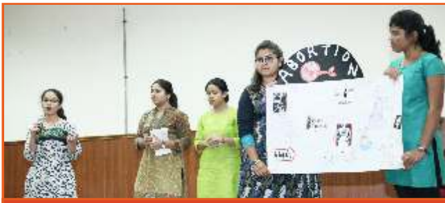
Legal Orientation Programme