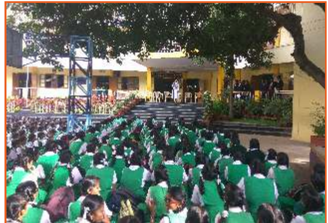
Legal Awareness Programme

A Legal Awareness Programme was organized by Legal Aid Cell of the College to orient the students on 'Cybercrimes and its Legal Consequences' at Nirmala Rani High School, Malleswaram, Bengaluru on 11 th November, 2017.