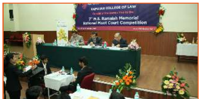
Final Round of Moot Court Competition