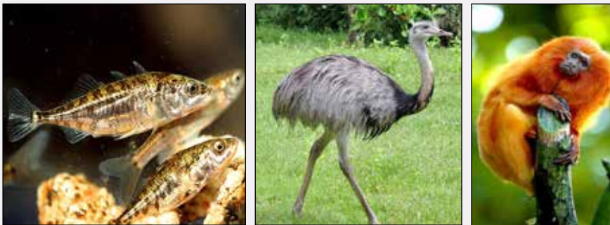
Figure 2: Parenting in Nature: (a) Three-spined stickleback fish (b) Rhea (c) Tamarin