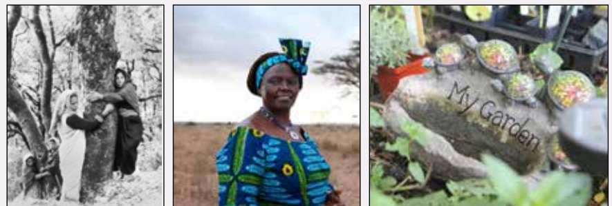
Figure 3: Ecofeminism: (a) Gaura Devi, Chipko Moment (1973) (b) Professor Wangari Maathai, Green Belt Movement (1977) (c) Community Garden (Harlem)

Ecofeminism Explained (Figure 3) – Gaura Devi, a peasant woman from the Garhwal region led a group of women to hug trees for saving them for being felled as part of Chipko Movement on March 26 th , 1974. In 1977, women united in Kenya to combat desertification by planting millions of trees, creating the green belt movement founded by Wangari Maathai. “Until you dig a hole, you plant a tree, you water it, and make it