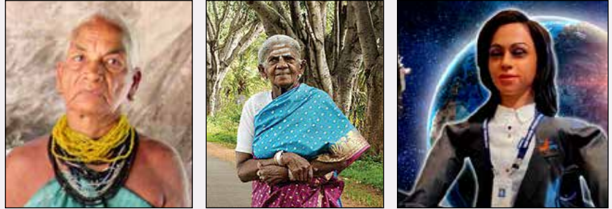
Figure 1: Portraits of Power: (a) Tulasi Gowda (b) Saalumarada Thimmakka (c) Humanoid Vyommitra (ISRO)

Portraits of Power: Woman Leading the Change (Figure 1) – Tulasi Gowda, the septuagenarian from Ankola is called an encyclopedia of forest knowledge. Having planted over 1,00,000 saplings, her extraordinary contribution towards conserving and rejuvenating the environment has been honored with a Padma Shri in 2020. The 100-years-plus environmentalist Thimmakka from Gubbi, grew and nurtured over 8000 trees and called Saalumarada or rows of trees, was awarded the Padma Shri in 2019. Over 3,280 women propel ISRO. 20% of staff at ISRO is women, with 2,069 women