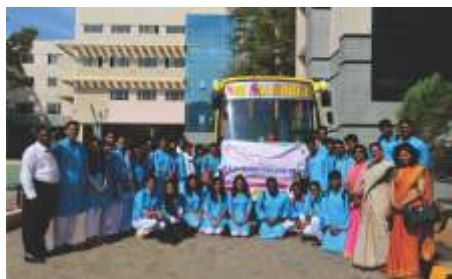
Door to Door campaign at Bagalur

On 22 nd October, 2016 the faculty members and students of 'Legal Aid Committee' visited Taluk Panchayat, Gowribidanur and had a meeting with Executive Officer of Gowribidanur and Panchayat Development Officer of Thondebhavi.