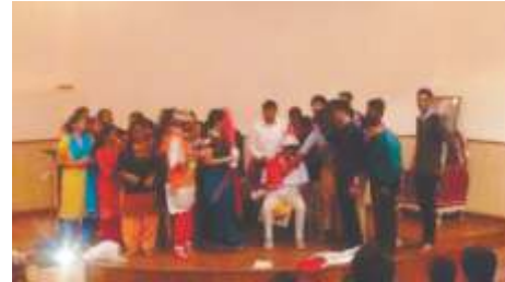
Personality Development Programme