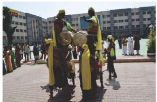
Kannada Rajyostava celebrations

The college celebrated 61 st Kannada Rajyostava on 11 th November, 2016. The event saw the cultural hues of Karnataka come alive. The Traditional dance form of Karnataka, Dollu Kunitha was organized on the event.