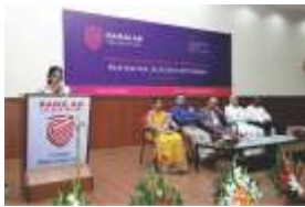
Inaugural Function for 1 year BA.LL.B