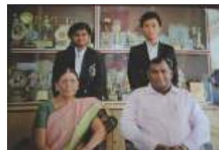
Winners of KSLU Inter Collegiate Shuttle Badminton Tournament