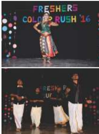
Fresher's Day celebrations