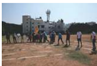
Annual Sports Meet

Annual Sports Meet was conducted from 19 th to 21 st October, 2016 at MSRIT Ground. Various Athletic events & Team events were conducted.