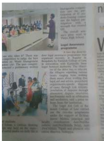
The Hindu, 14 th November, 2016